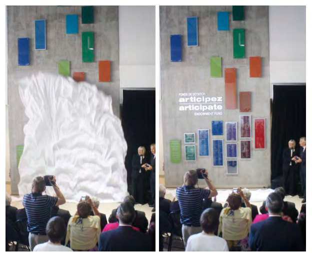
Donor Wall unveiling, Photos by Etienne Ranger

The new ARTicipate website was launched in the fall of 2010. This dynamic new site features an expanded online donation tool, as well as information for donors on the many options available to support the Fund.