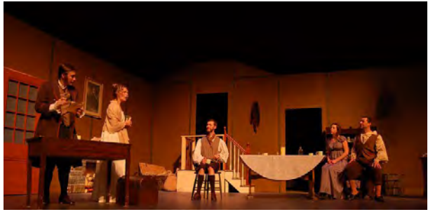
A scene from Vintage Stock Theatre's A Dickens of a Christmas