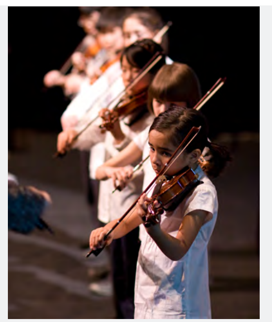
Suzuki School of Music