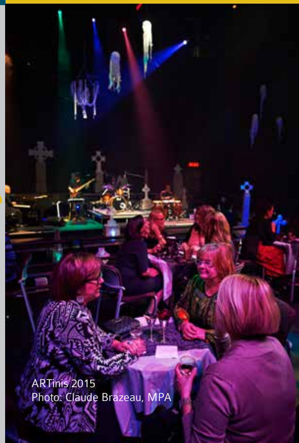
ARTinis 2015