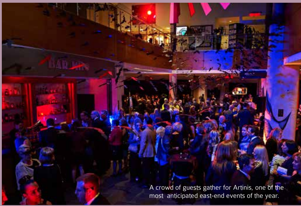
A crowd of guests gather for Artinis, one of the most anticipated east-end events of the year.