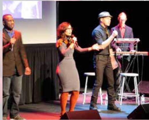
The PepTides keynote speakers - ARTPRENEUR Ottawa Conference Saturday, Oct. 17, 2015.

On October 17 along with our co-producing partners (Ottawa School of Art, Shenkman Arts Centre and Wallack's Art Supplies), we welcomed 150 delegates, exhibitors and speakers to our annual full day conference. The theme 'Innovating Indie' responded to a significant trend among artists toward independent creative production and distribution outside of traditional models. Delegates learned how to apply business skills to help them succeed as independent artists or collectives, be clever self-marketers and be inspired by those who know the passion of constant innovation. With keynote by The PepTides, artists from all disciplines made connections and gained new skills.