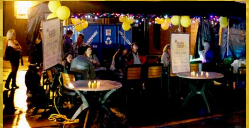
Nuit Blanche Ottawa+Gatineau, Human Library.

We presented the Arts Human Library for the third time at Nuit Blanche in Sept. 2015. 18 artists of various disciplines were available for the public to 'loan' for conversations. Over 80 people took out 85 loans and 225 people came through the event. The Arts Council also supported the operations of NBOG by coordinating the open call for artists.