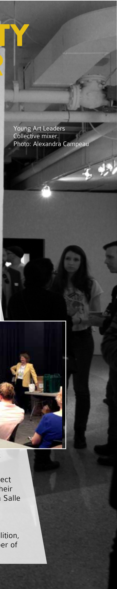
Young Art Leaders Collective mixer.

Cultural Human Resources Council, Eastern Ontario Arts Council Network, Canadian Arts Coalition, Volunteer Ottawa, WorkinCulture, Artist-Run Centres & Collectives of Ontario, Orléans Chamber of Commerce and are new members of Hub Ottawa and West Ottawa Board of Trade.