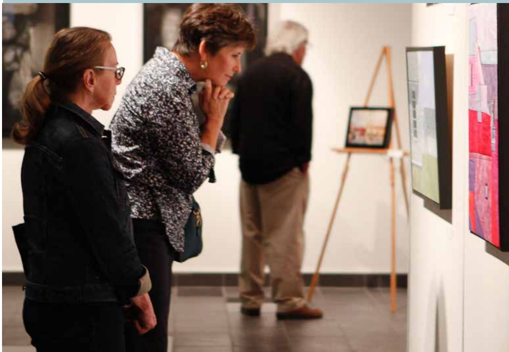
SELECTIONS 2015, Trinity Art Gallery – Shenkman Arts Centre, opening night where over 150 guests and the public met with AOE Arts Council member artists.