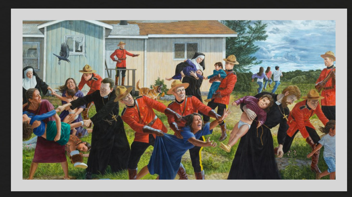
Kent Monkman, The Scream, 2016.

Art is not <u>ahistorical</u> Art is not <u>apolitical</u> Art is not <u>acontextual</u>