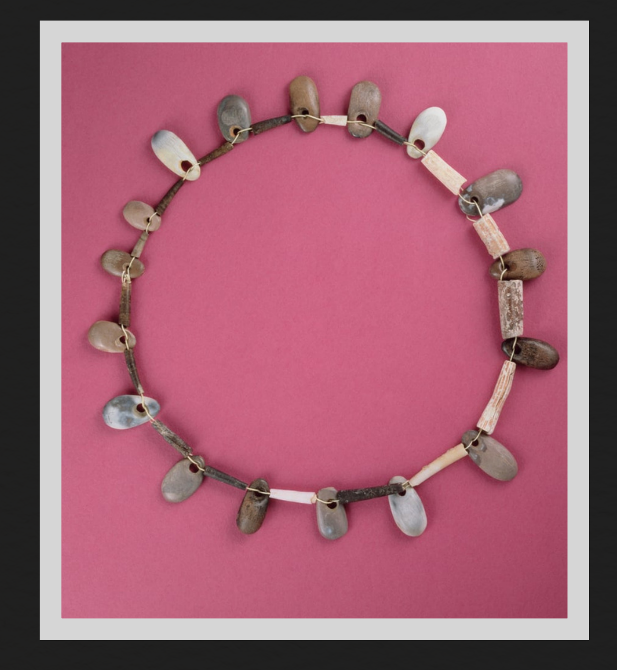
Prehistoric Necklace, found in caves in Palestine (shell and bone)