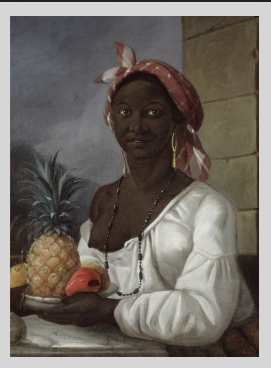
Portrait of a Negro Slave or Negress/ Portrait of a Haitian Woman1786)