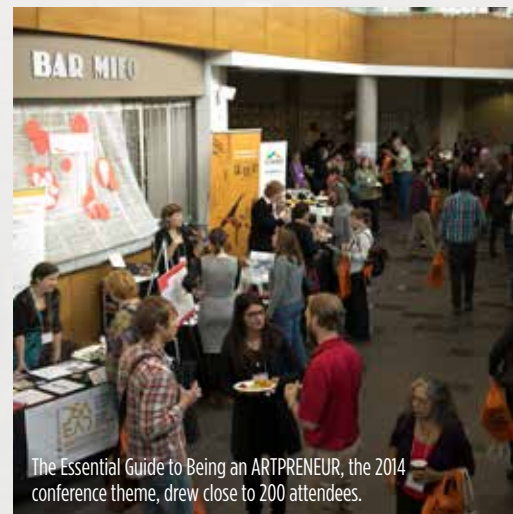
The Essential Guide to Being an ARTPRENEUR, the 2014 conference theme, drew close to 200 attendees.