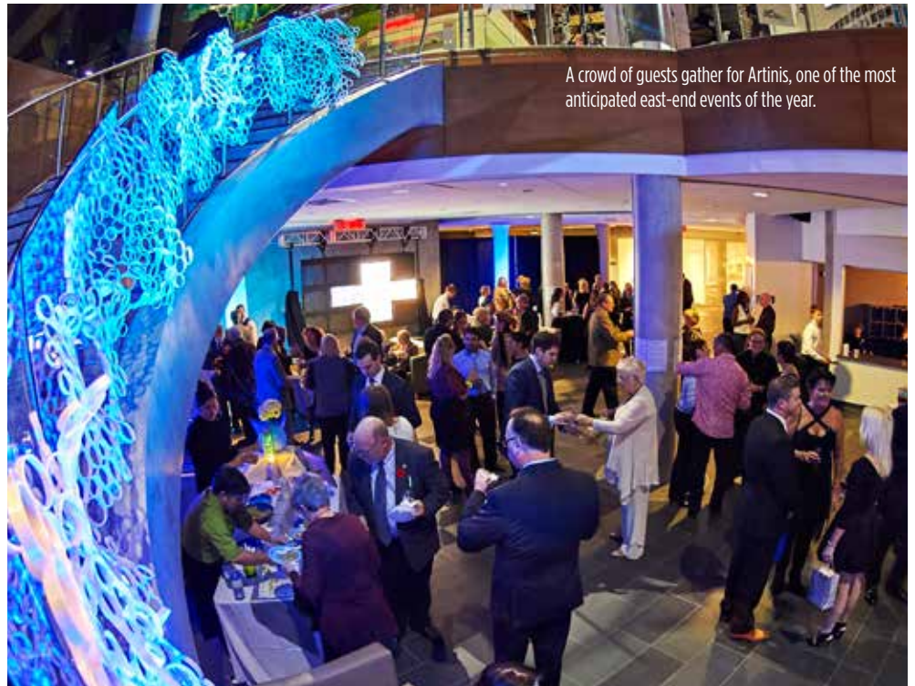
A crowd of guests gather for Artinis, one of the most anticipated east-end events of the year.